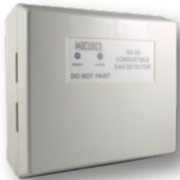
GD-2A (Combustible Gas)