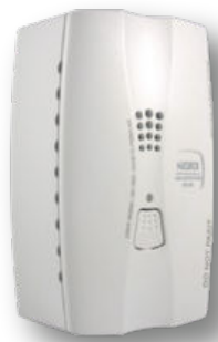
GD-2B (Combustible Gas)